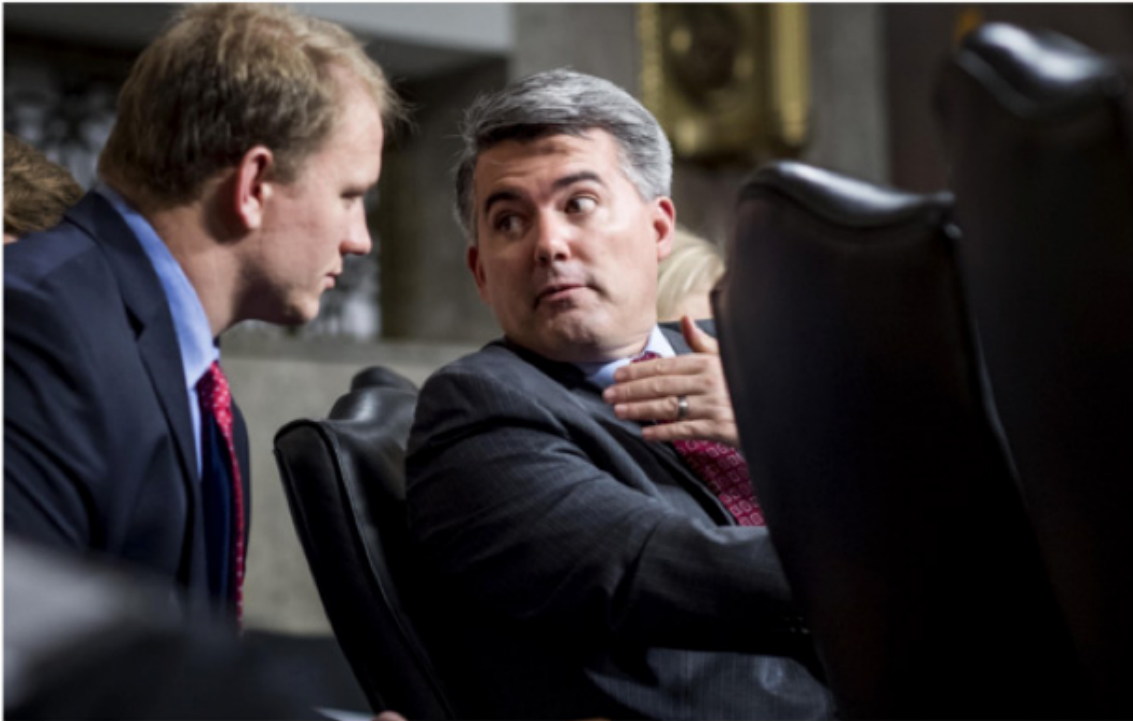
Seattle Seahawks guard Will Pericak, left, works with Senator Cory Gardner (R-Colo.) during a hearing on Capitol Hill.

https://www.washingtonpost.com/sports/redskins/political-football-nfl-players-spend-three-weeks-working-on-capitol-hill/2017/03/02/1bb98020-f7a-11e6-99b4-9e613afeb09f_story.html?utm_term=.163543f7c2e1